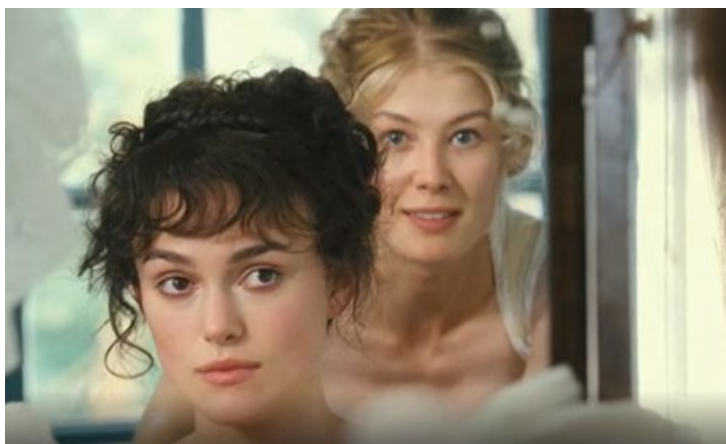
2005 film, Moggach