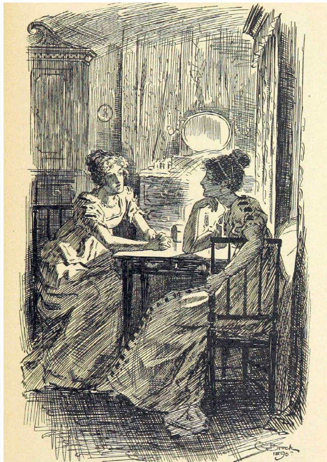
C. E. Brock, 1894, public domain

Think about where they are; what they are doing; their surroundings; their body language.