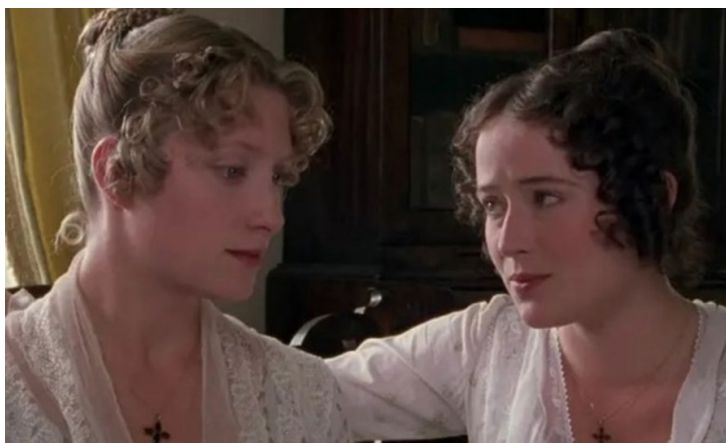
1995 BBC, Davies